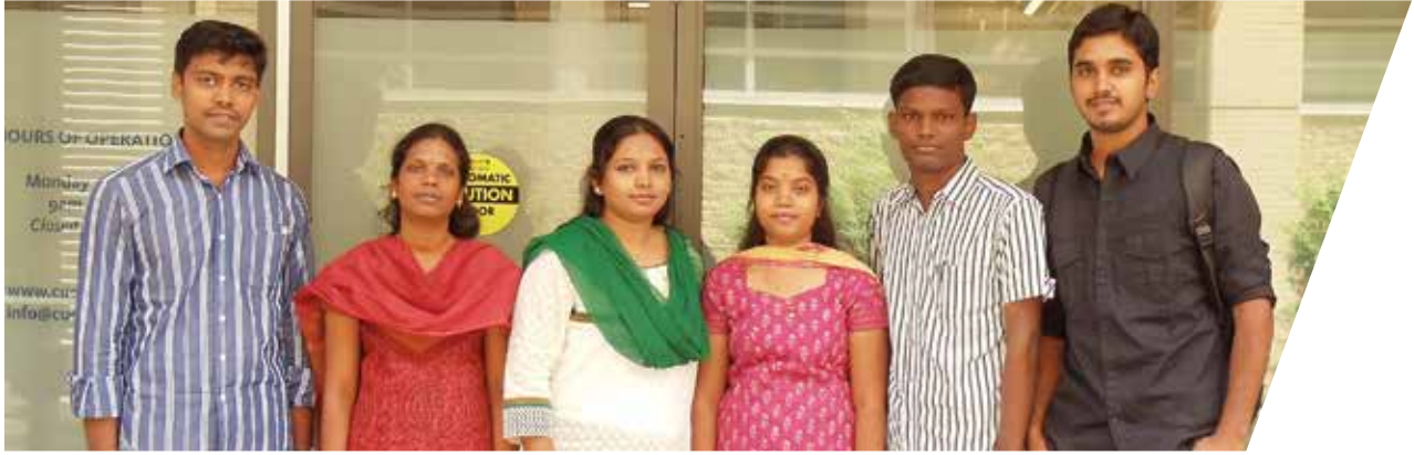
Interns from Anna University